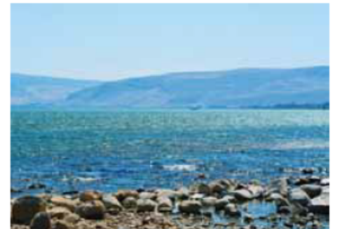
View of the Sea of Galilee from the shore

Disciples normally chose to follow the rabbi whose teachings and way of life impressed them: Jesus is unusual in selecting his disciples.