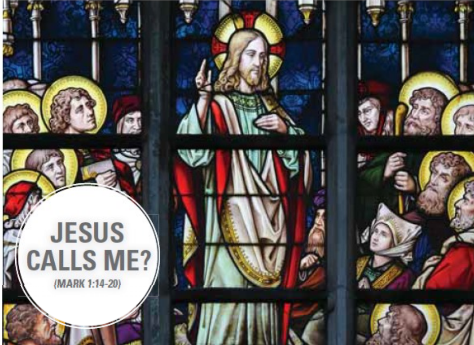
Stained glass window in St Gummarus Church in Lier, Belgium

Our Gospel extract today falls into two sections. After the notice about the arrest and imprisonment of John the Baptist, we have an example of a characteristic feature of Mark's account, that of the summary statement.