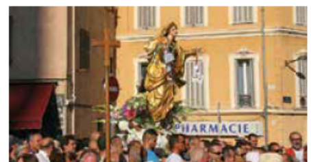
The statue of the Virgin Mary is escorted during the annual Assumption procession in the Le Panier district of Marseille, France.

Today we celebrate the feast of the Assumption of Mary. We celebrate our belief that Mary was taken up, body and soul, into heaven, where she enjoys eternal life in the company of her son. It is a joyful feast for us Christians because it points to what we believe will be our destiny. We believe that what God has done for Mary, God will do for us also; that at the end of time God will raise our mortal bodies and bring us into the fullness of God's life for ever.